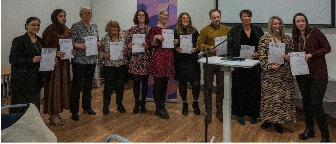
Team of the Year Cheshire East Occupational Therapists