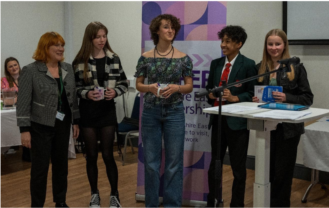
Crewe Lyceum Senior Youth Theatre collecting the Making a Difference in the Community Award